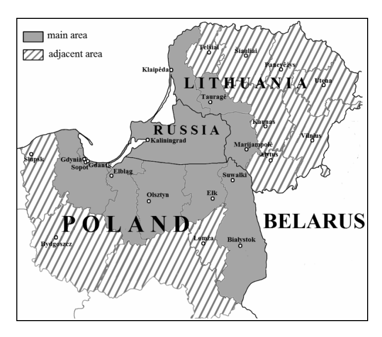
Fig. 4. The region of the Lithuania-Poland-Russia neighbourhood programme