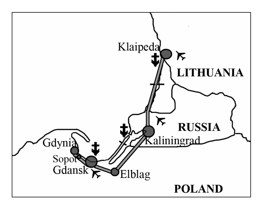
Fig. 1. The tripolar system: Tricity (Poland) — Kaliningrad (Russia) — Kalipeda (Lithuania)

In the cases when transborder regions are located between two core regions of the neighbouring countries they can evolve into peculiar regions-development corridors extending the well-known region classification drawn up by Friedmann [6] (fig. 1).